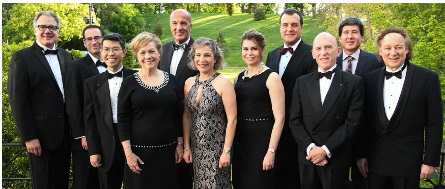
New Members of the AOS