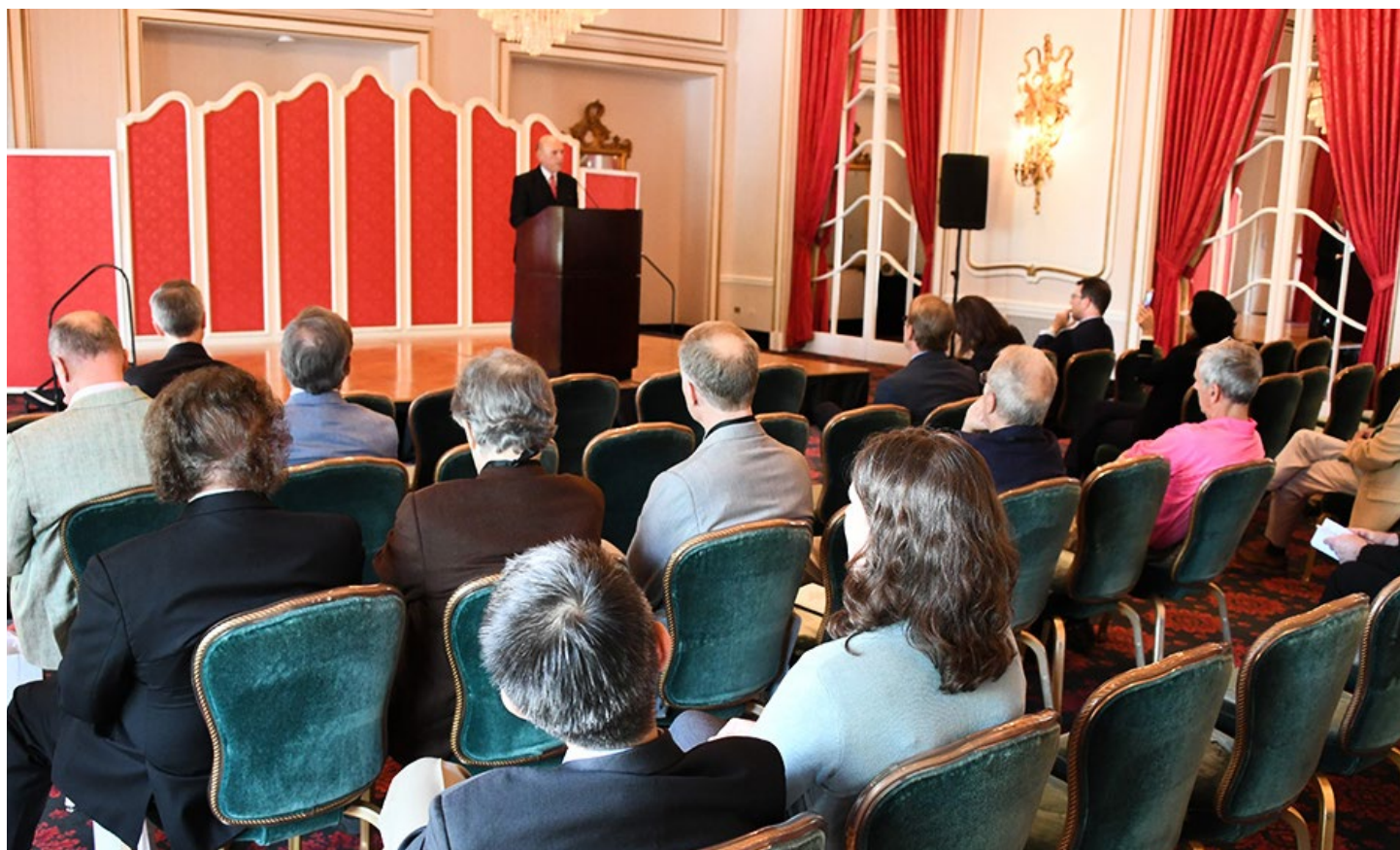
New Member Spotlight Presentations

PATTERNS AND RISK FACTOR PROFILES OF VISUAL LOSS IN A MULTIETHNIC ASIAN POPULATION: THE SINGAPORE EPIDEMIOLOGY OF EYE DISEASES STUDY