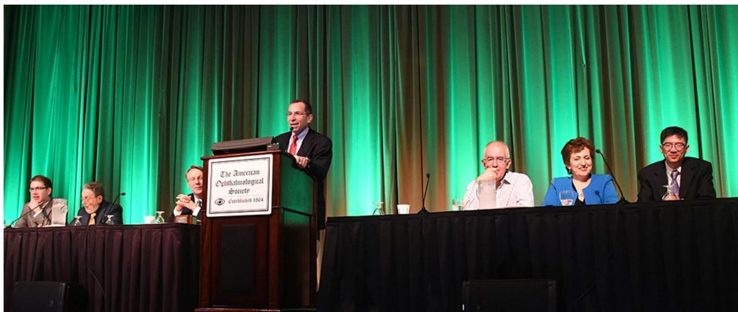
Artificial Intelligence and Machine Learning Symposium